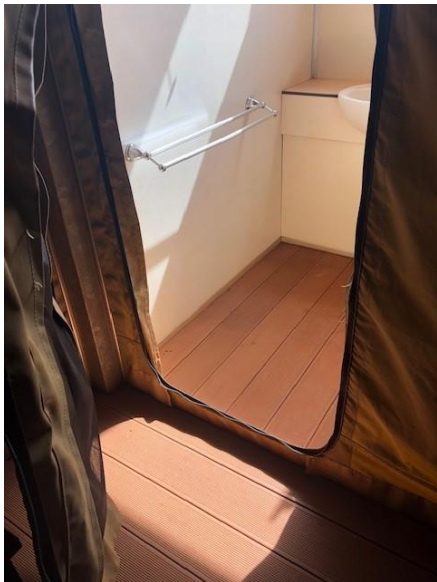
Deluxe Tent; Bathroom Entry