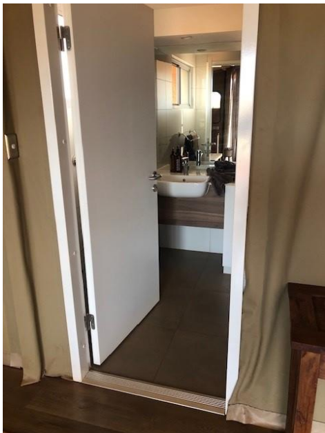
Luxury Tent; Bathroom entry