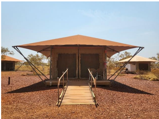
Tent 13 – Deluxe Tent