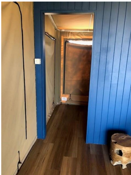
Deluxe Plus Tent; Bathroom entry