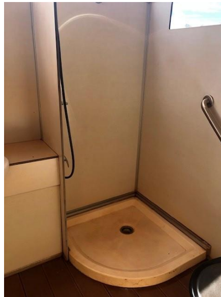
Deluxe Tent; Shower Entry