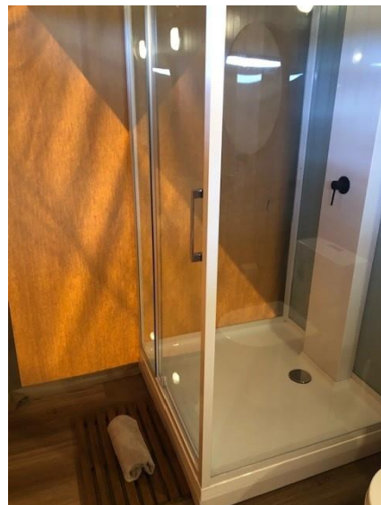
Deluxe Plus Tent; Shower entry